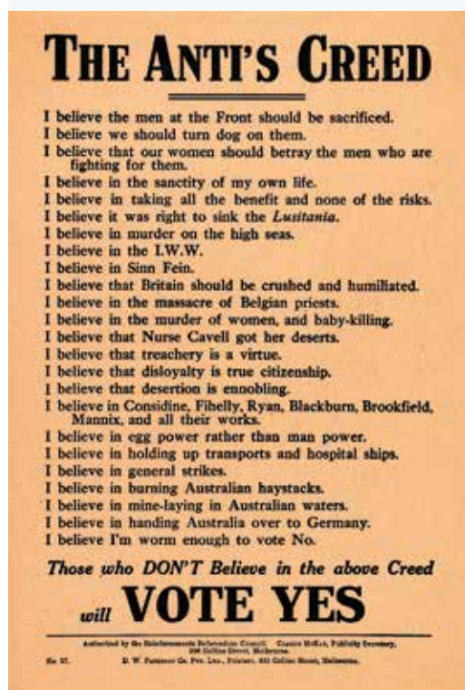
The Anti's Creed , a poster outlining the supposed characteristics of the anti-conscriptionists

SOURCE 1 The Anti's Creed , a leaflet supporting conscription in the 1917 referendum