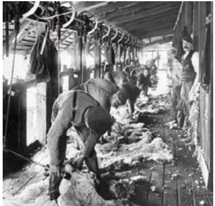
Source 4 Wool, used to make soldiers' uniforms, was a valued commodity during the war.

However, many workers felt that they were not sharing in the wartime profits. Wages fell but the cost of living rose. This led to some resentment and even strike action in the coal industry, and on the railways and the wharves. These strikes drew much criticism. The strikers were described as unpatriotic and selfish, and they were largely unsuccessful.