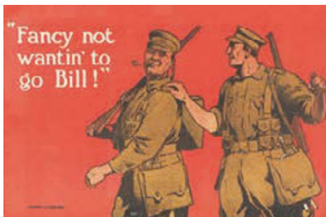
Source 1 An Australian poster from 1917 encouraging Australians to enlist. After heavy casualties on the Western Front, Britain pressured Australia to make a bigger contribution to the war effort.

In 1914, the federal government passed the War Precautions Act, which gave the government increased powers for the duration of the war. This Act gave the federal government the legal right to, among other things, monitor and intern German-Australians, impose a direct income tax, censor letters and publications, and set fixed prices for certain goods.