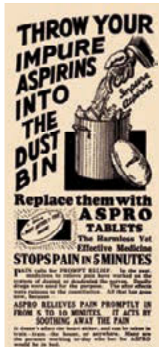
Source 3 Aspro was developed in Australia as a direct result of the war.

There were people who profited from supplying goods needed for the war effort. These included farmers who supplied wheat, dairy products and meat to feed the soldiers here and overseas. Wool was in great demand for soldiers' uniforms (see Source 4) and munitions factories were working overtime to support the war effort.