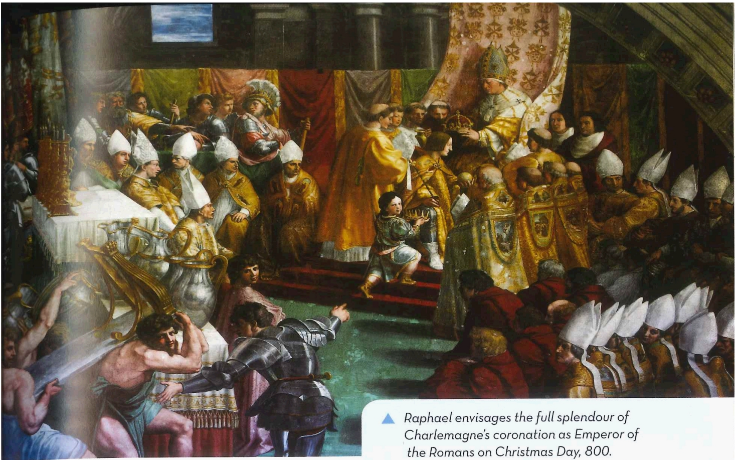
▲ Raphael envisages the full splendour of Charlemagne's coronation as Emperor of the Romans on Christmas Day, 800.

own. He was brave, strong-willed and physically imposing – standing at 1.9 m (6 feet 3 inches) at a time when the average height was only 1.69 m (5 feet 7 inches).