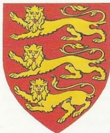
THE COAT OF ARMS OF JOHN

THE YOUNGEST SON OF HENRY II, John inherited from his brother Richard the throne of England, as well as the Plantagenet dominions in France, which he lost to the French by 1204. John's failure to recapture these territories, his dispute with Rome over the Pope's choice of a new Archbishop of Canterbury, and a high level of taxation had the English nobility up in arms against him. In 1215 they forced the King to agree to the Magna Carta, guaranteeing their rights in relation to those of the crown. This led to civil war, which only ended with John's death in 1216. Yet despite these disasters, it is now known that John was a much better king than history has usually portrayed him.